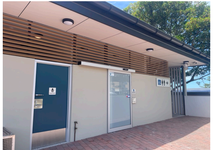
The Entrance Visitor Information Centre