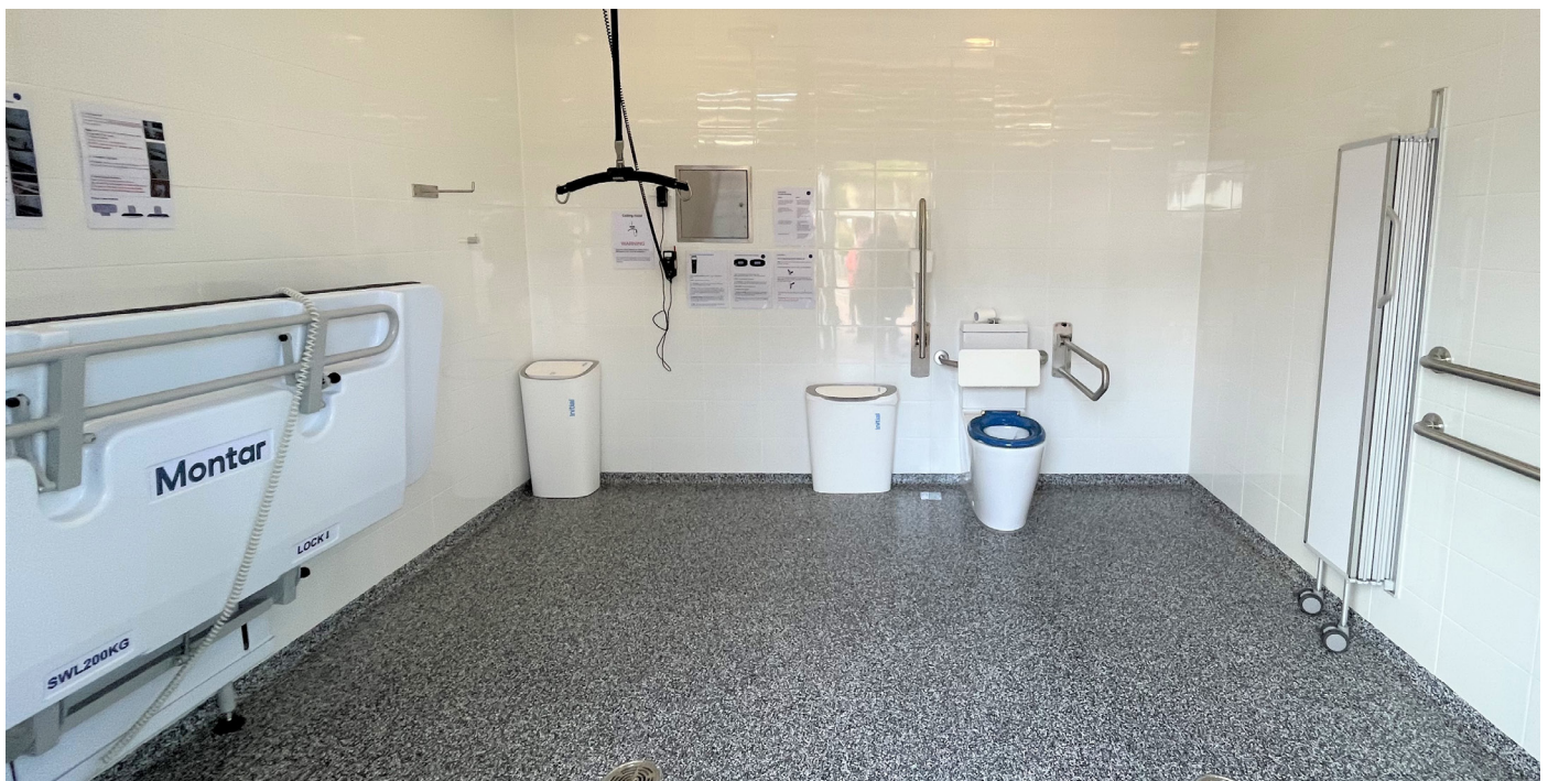
An example of multi-functional features as included in the Accessible Adult Change Facility at The Entrance Visitor Information Centre