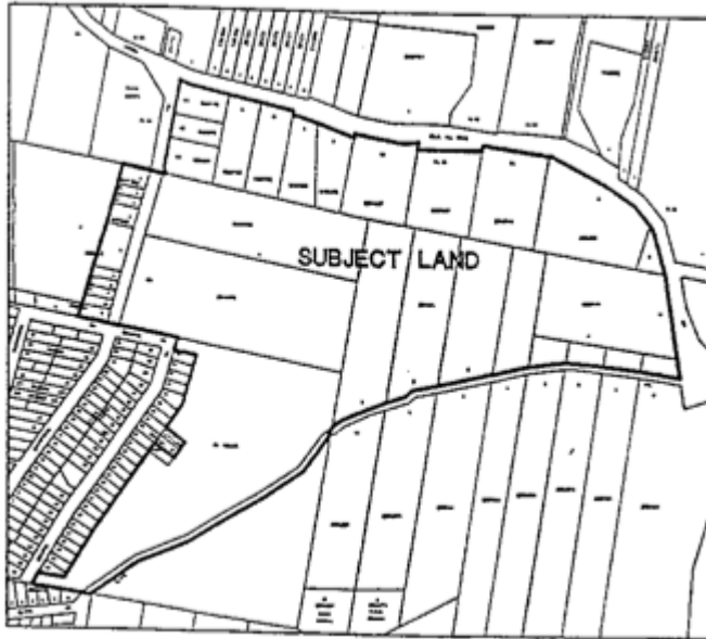
Figure 1 – Land to which this chapter applies

This chapter applies to land bounded by and adjoining Avoca Drive, Elvys Avenue and Davistown Road as shown on the map below.