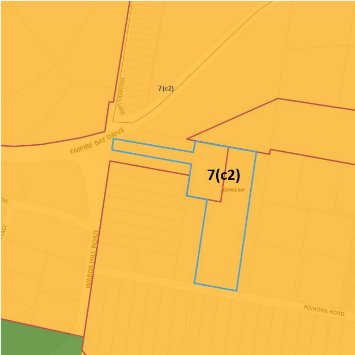
Figure 2 – Existing Zoning under IDO 122

The land is zoned 7(c2) Conservation and Scenic Protection (Scenic Protection – Rural Small Holdings) under Interim Development Order No 122 – Gosford (IDO 122) (Figure 2).