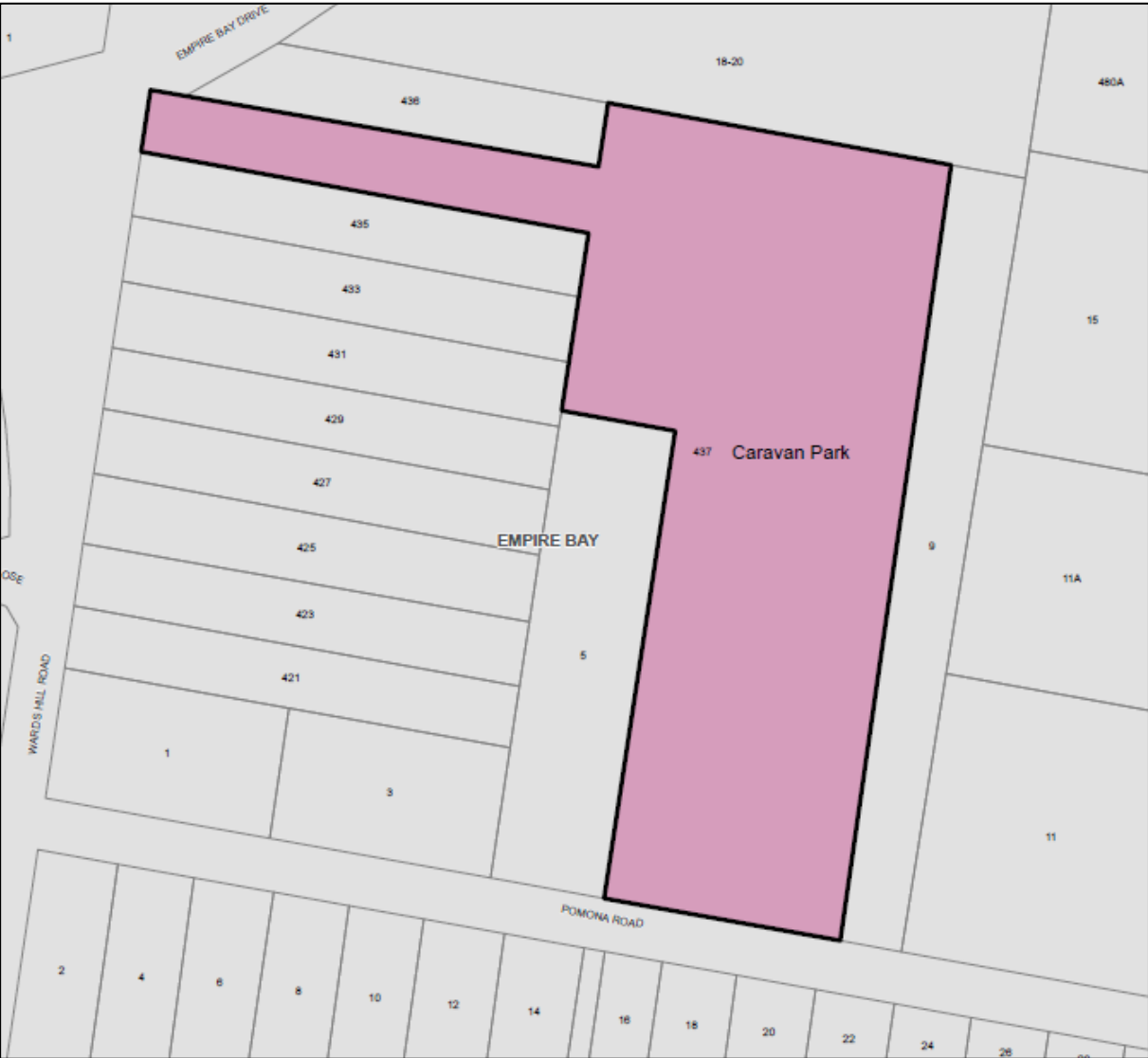
Figure 12 – Proposed Additional Permitted Use under CCLEP