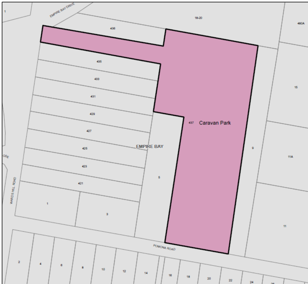
Figure 4 – Proposed APU under CCLEP

Most of the existing dwellings on the site are affected by flooding, however the use has been operating on this site for approximately 40 years. The caravan park has been used for long-term accommodation since, at least 2006, when consent was issued for this type of accommodation. It was not until the decision by the Court of Appeal in 2018 that the validity of this 2006 consent was questioned.