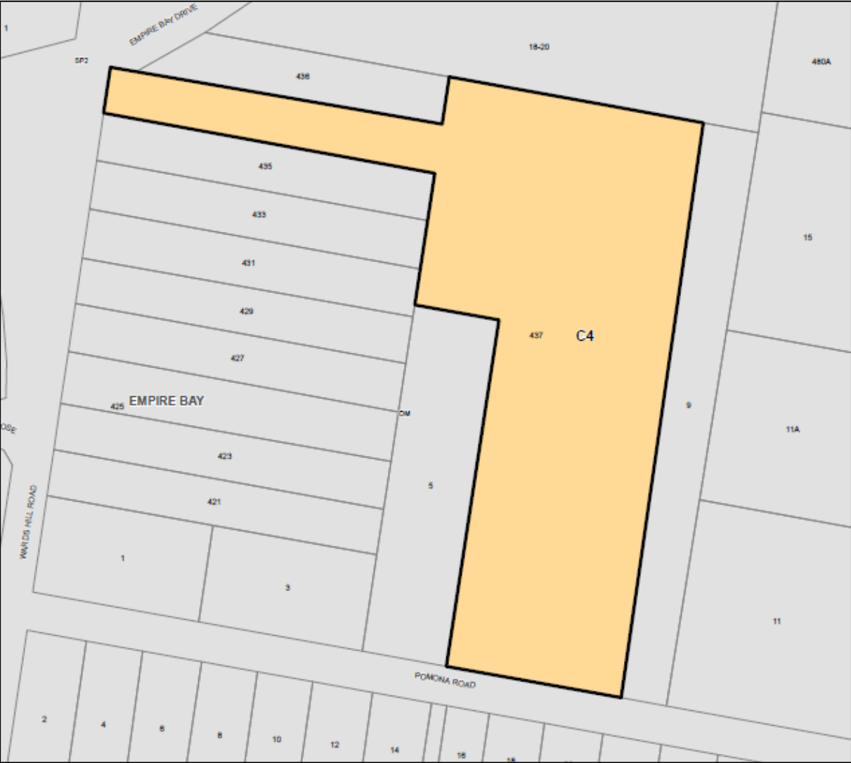
Figure 10 – Proposed Zone under CCLEP