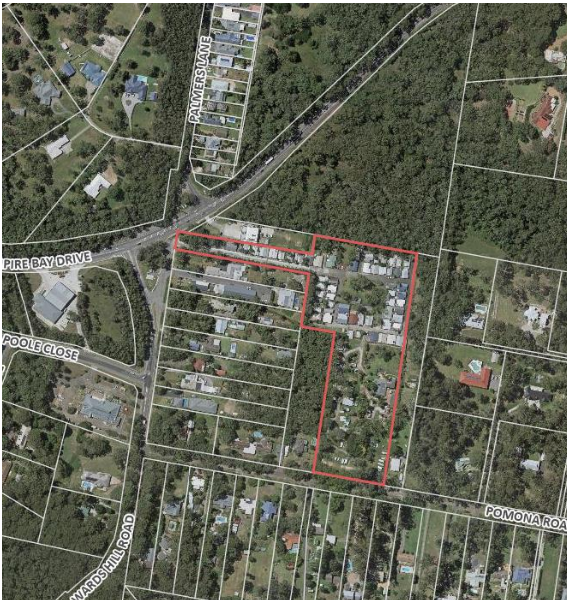
Figure 1 – Aerial Photograph

The southern boundary is the highest part of the site with an elevation of 17m AHD. The land falls to 9m AHD in the north-western part of the site.