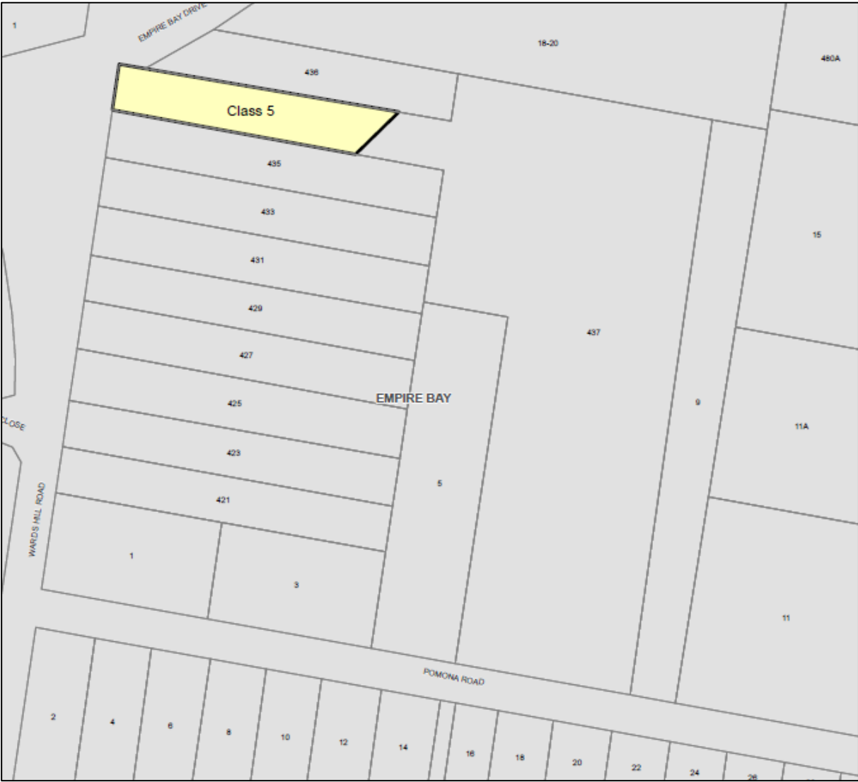
Figure 13 – Proposed Acid Sulfate Soil under CCLEP