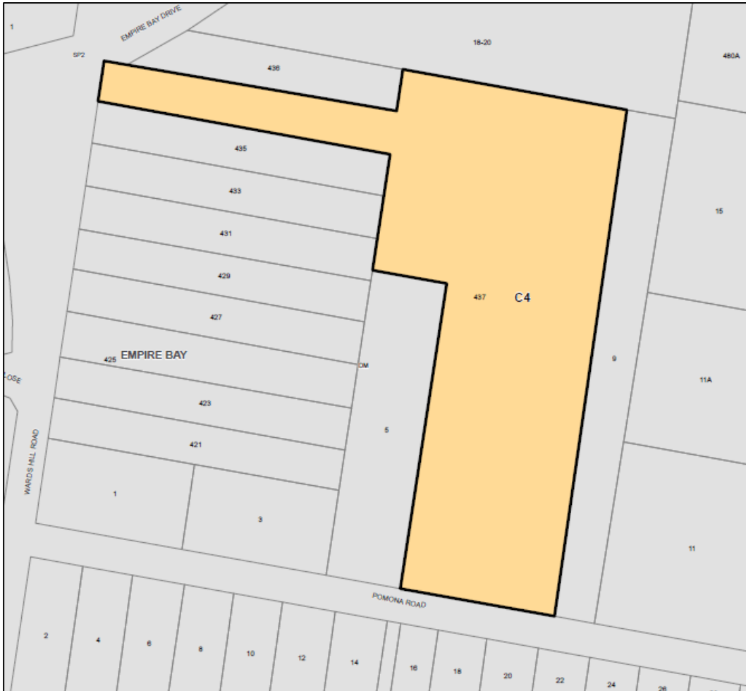
Figure 3 – Proposed Environmental Living Zone under CCLEP