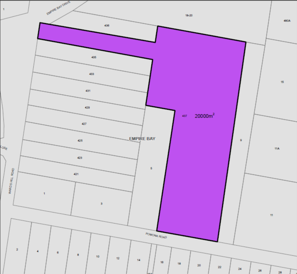
Figure 11 – Proposed Minimum Lot Size under CCLEP