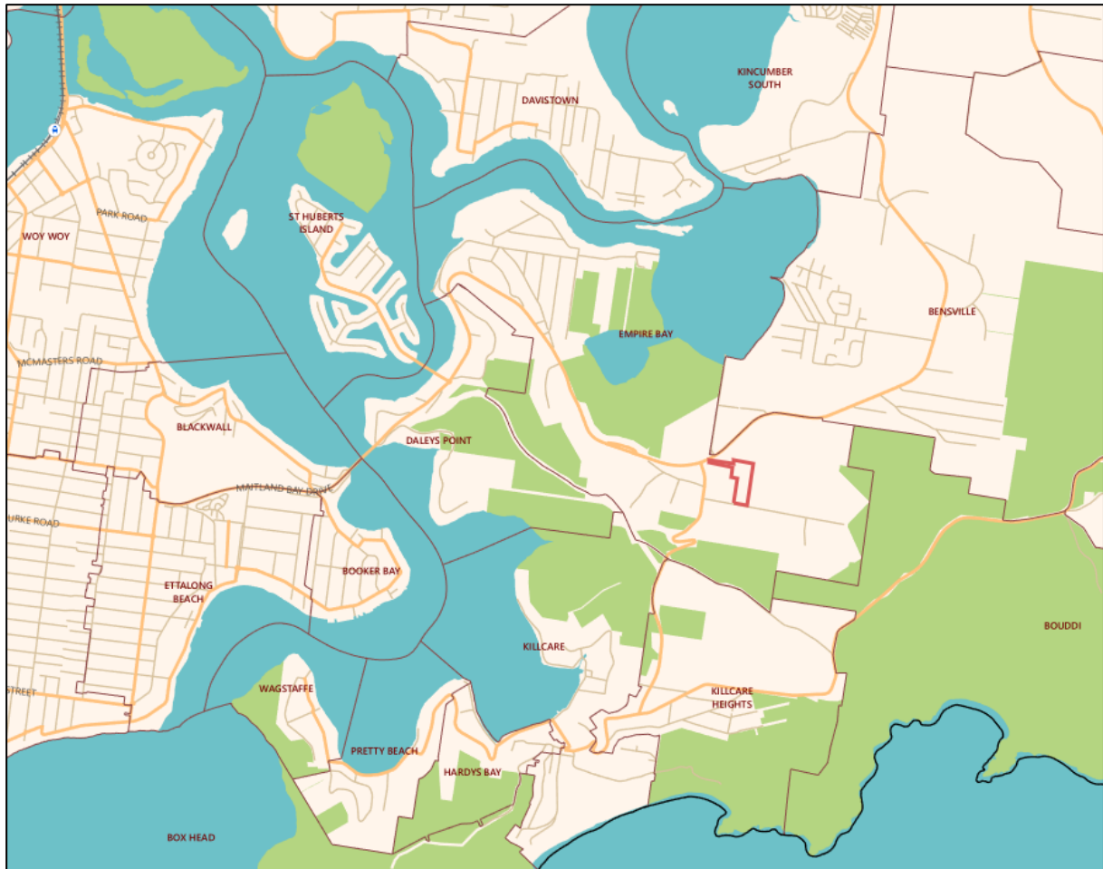
Figure 7 – Subject land to be rezoned shown in context of broader locality