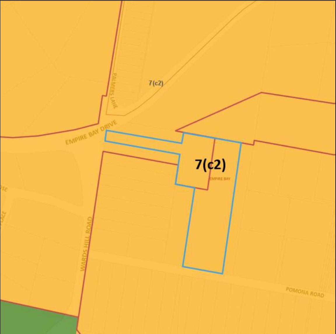
Figure 9 – Existing Zone

7(c2) Conservation and Scenic Protection (Scenic Protection – Rural Small Holdings)