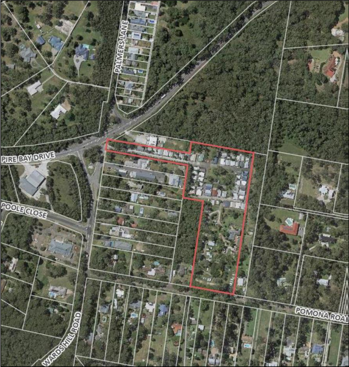
Figure 8 – Aerial Photograph of land proposed to be rezoned