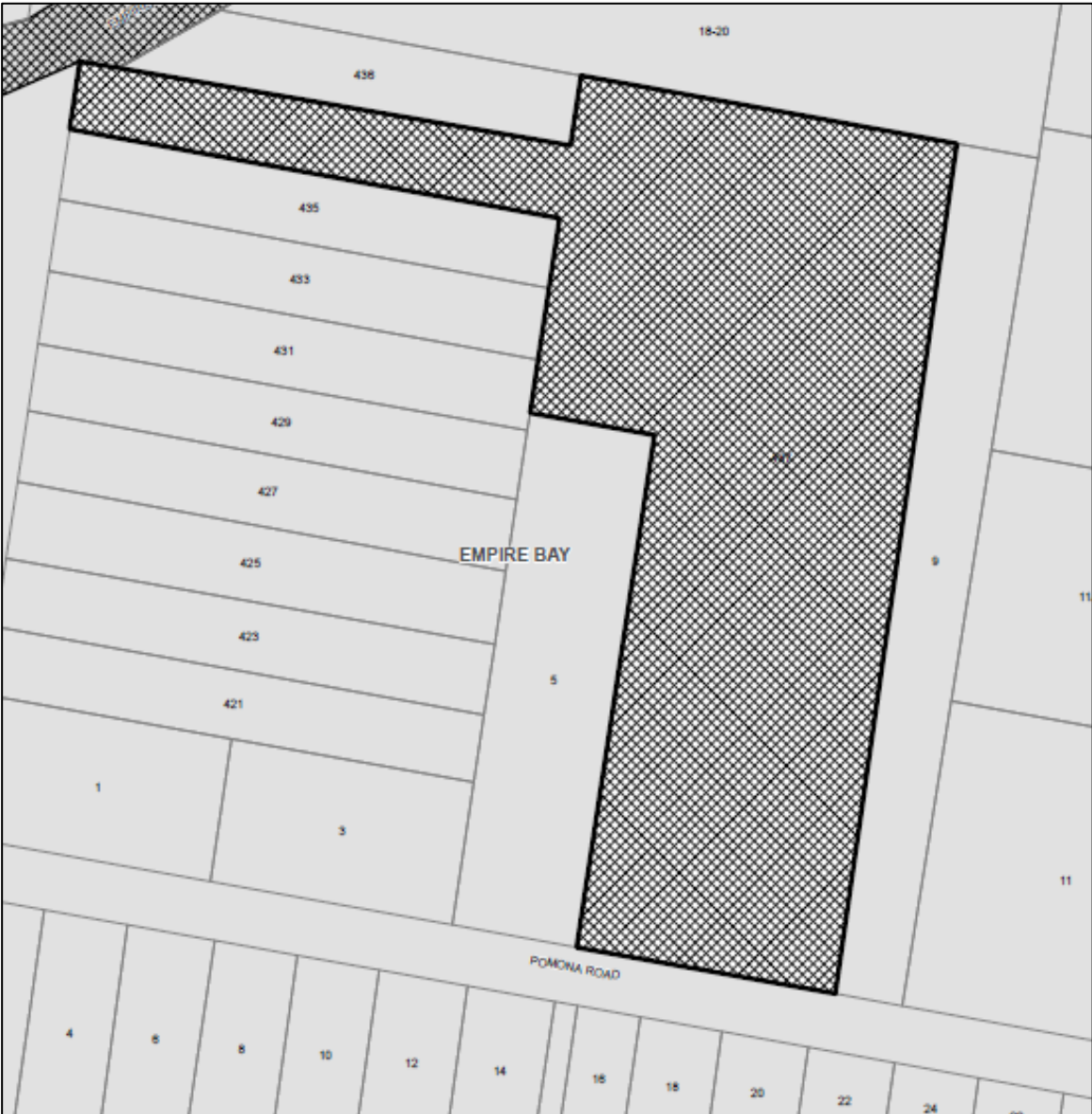
Figure 14 – Proposed Land Application Map under CCLEP