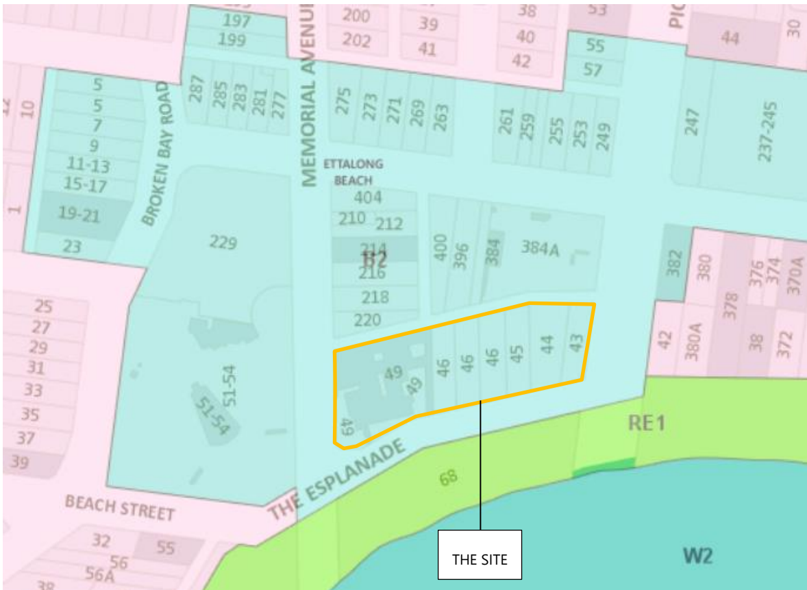
Figure 2 Land Use Zones (bounded in yellow)