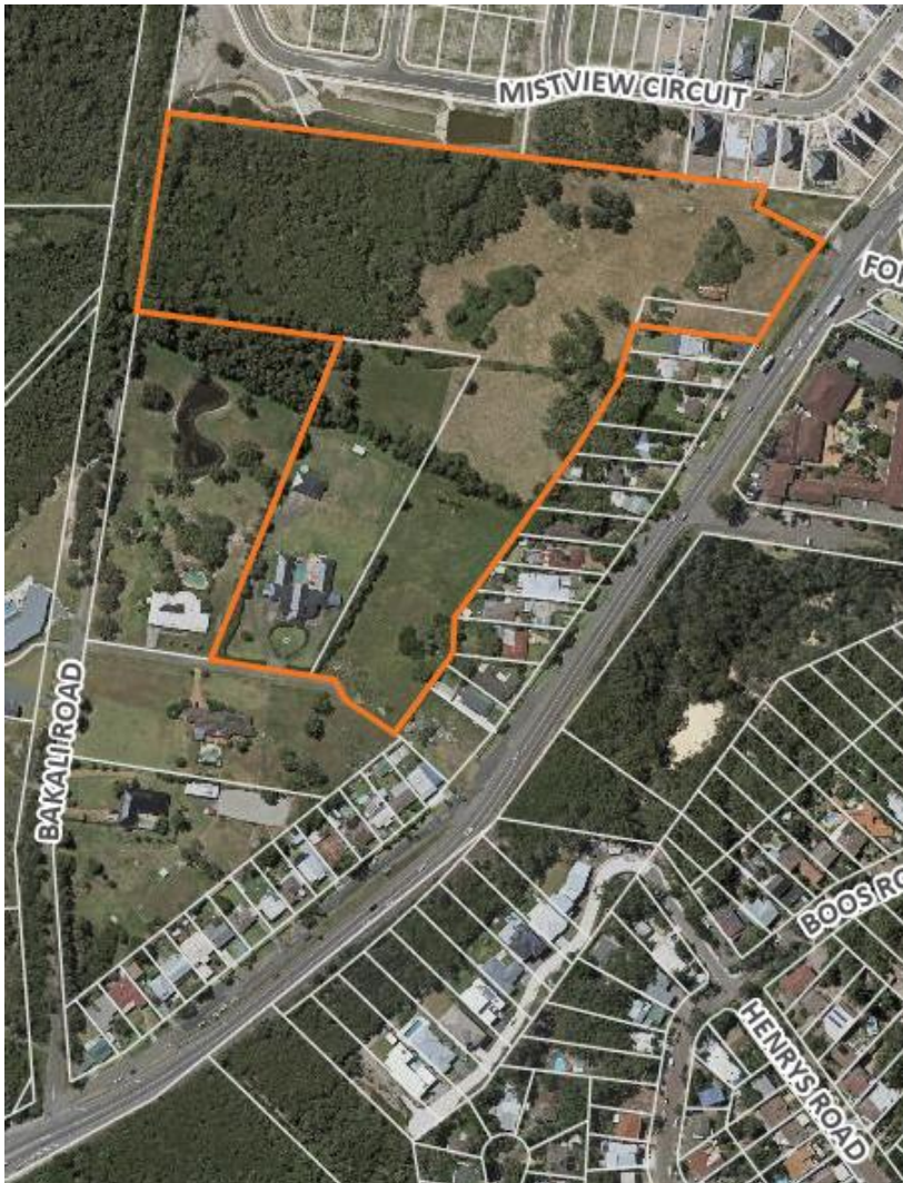
Figure 4 - Land subject to the proposed Planning Agreement.

The land subject to the proposed Planning Agreement is outlined in Figure 4.