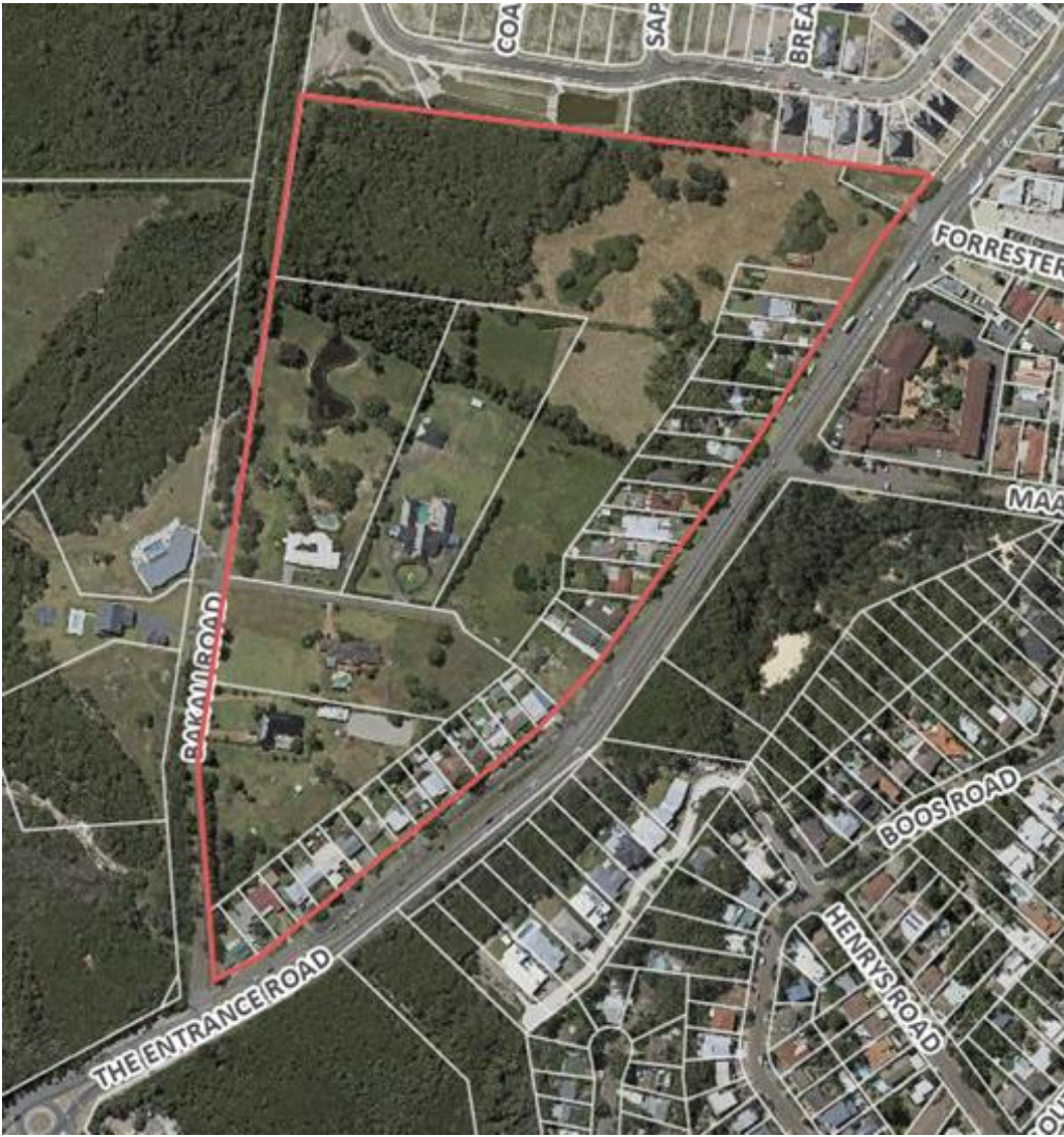
Figure 1 - Aerial Photograph of Forrester's Beach site

All of the subject 37 lots are zoned 7(c2) Conservation and Scenic Protection (Scenic Protection - Rural Small Holdings) under Interim Development Order No 122 (IDO 122), with the exception of Lot 522 DP 1077907, which is zoned part 7(c2) Conservation and Scenic Protection (Scenic Protection - Rural Small Holdings) and part 7(a) Conservation and Scenic Protection (Conservation) (Figure 2).