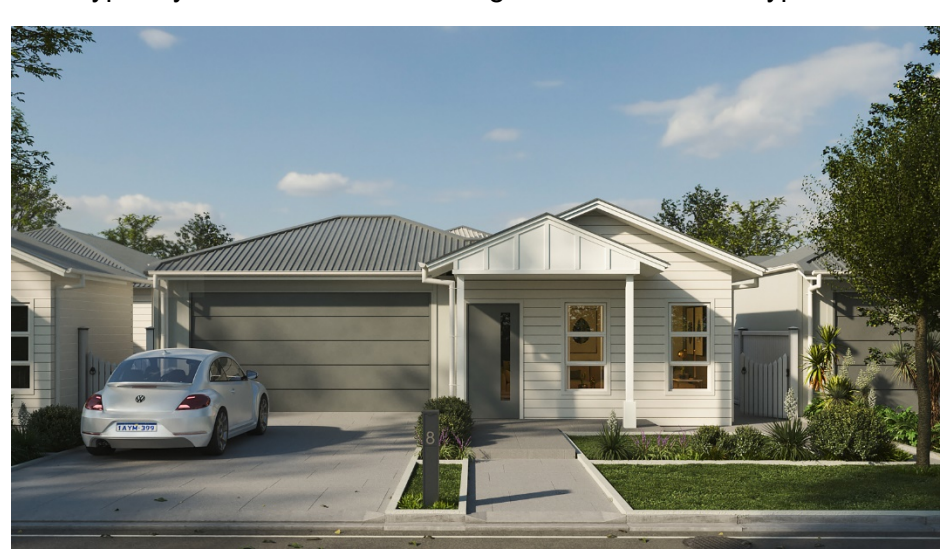
Typical manufactured home