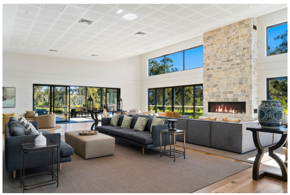
Clubhouse lounge room