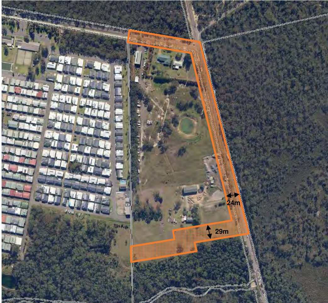
Figure 4: Asset Protection Zones

The Asset Protection Zones to the north and east can be partly contained within the road reserves of Mulloway Road and Chain Valley Bay Road. The extent of required Asset Protection Zones within the site is illustrated in the plan below.