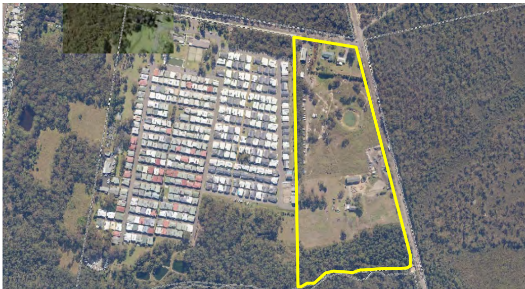
Figure 2: Map of Site (Satellite)