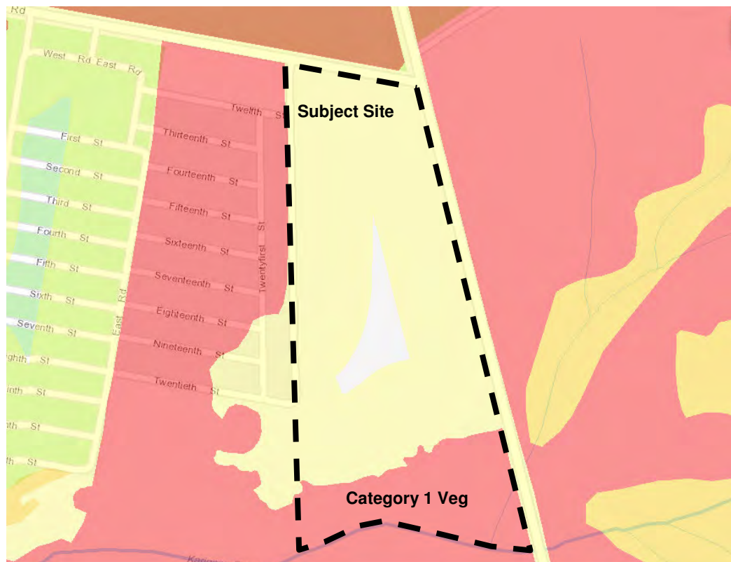
Figure 3: Bushfire Prone Land Map)

The subject land is identified as Bushfire Prone Land as described in Section 4.14 of the Environmental Planning and Assessment Act 1979 . The area is mapped as containing areas of Category 1 vegetation along the southern parts of the site, and buffer areas to category 1 vegetation.