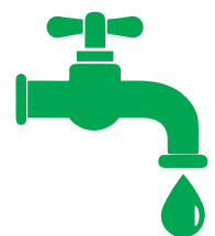
Very reliable supply