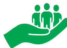
Low social impact