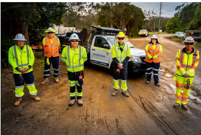
Image: The Traffic Management Team helped keep the community safe whilst moving through active construction zones

Traffic management activities have concluded along local roads. The Project Team wishes to thank the community for their consideration of traffic management operations during the construction period.