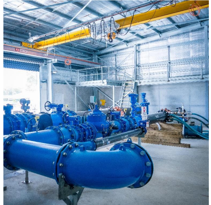
Inside the Valve House on Albert Warner Drive during works (now completed)

Now that the pipeline and the Valve House on the Albert Warner Drive road verge near Sparks Road Warnervale have been completed and commissioned by the joint venture company, Spiecapag and Seymour Whyte (SSWJV), Central Coast Council will officially take over the operation and management of the water line and associated facilities.