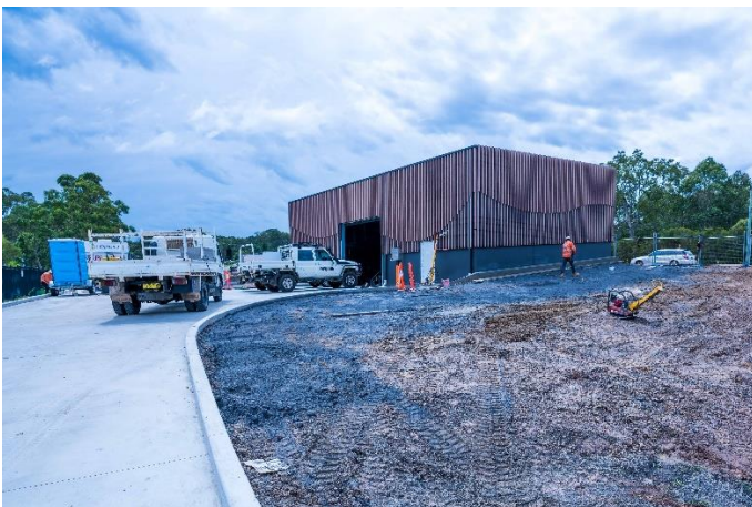
Image: Valve House on Albert Warner Drive during works (now completed)