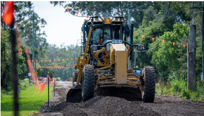
Image: Final reinstatement of the pipeline route.