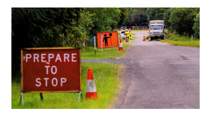
Image: Traffic management keeping the community safe during construction

Please drive safely and observe instructions from our traffic management crews.