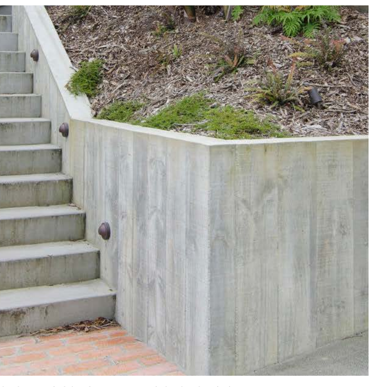
Insitu concrete retaining wall