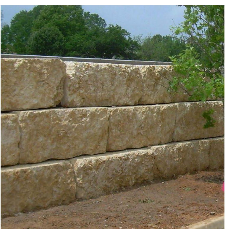
SANDSTONE LOG RETAINING WALL