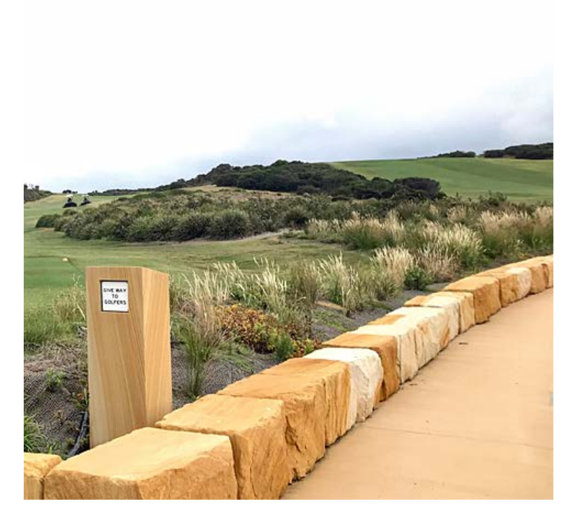
SANDSTONE LOG RETAINING WALL