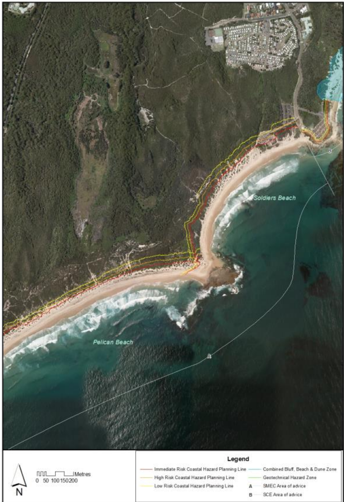
Soldiers Beach to Pelican Beach