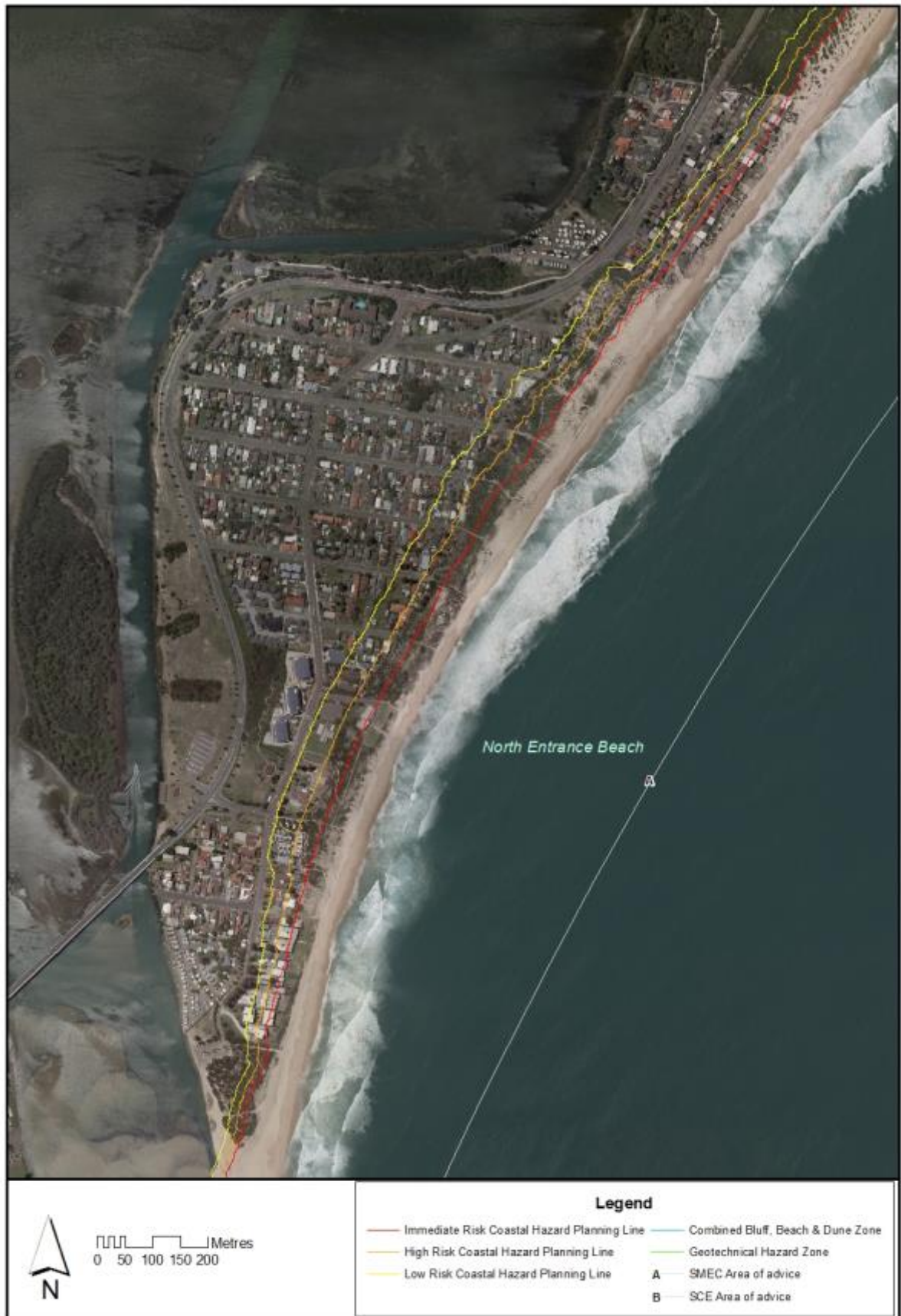
North Entrance Beach