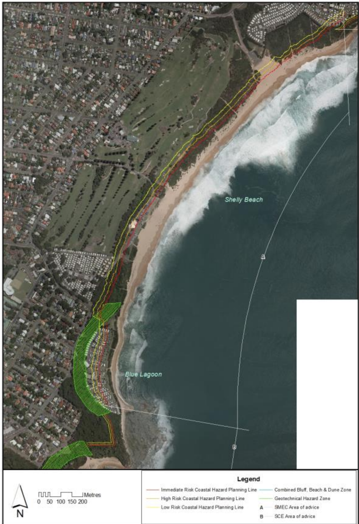
North Shelly Beach to Blue Lagoon Beach