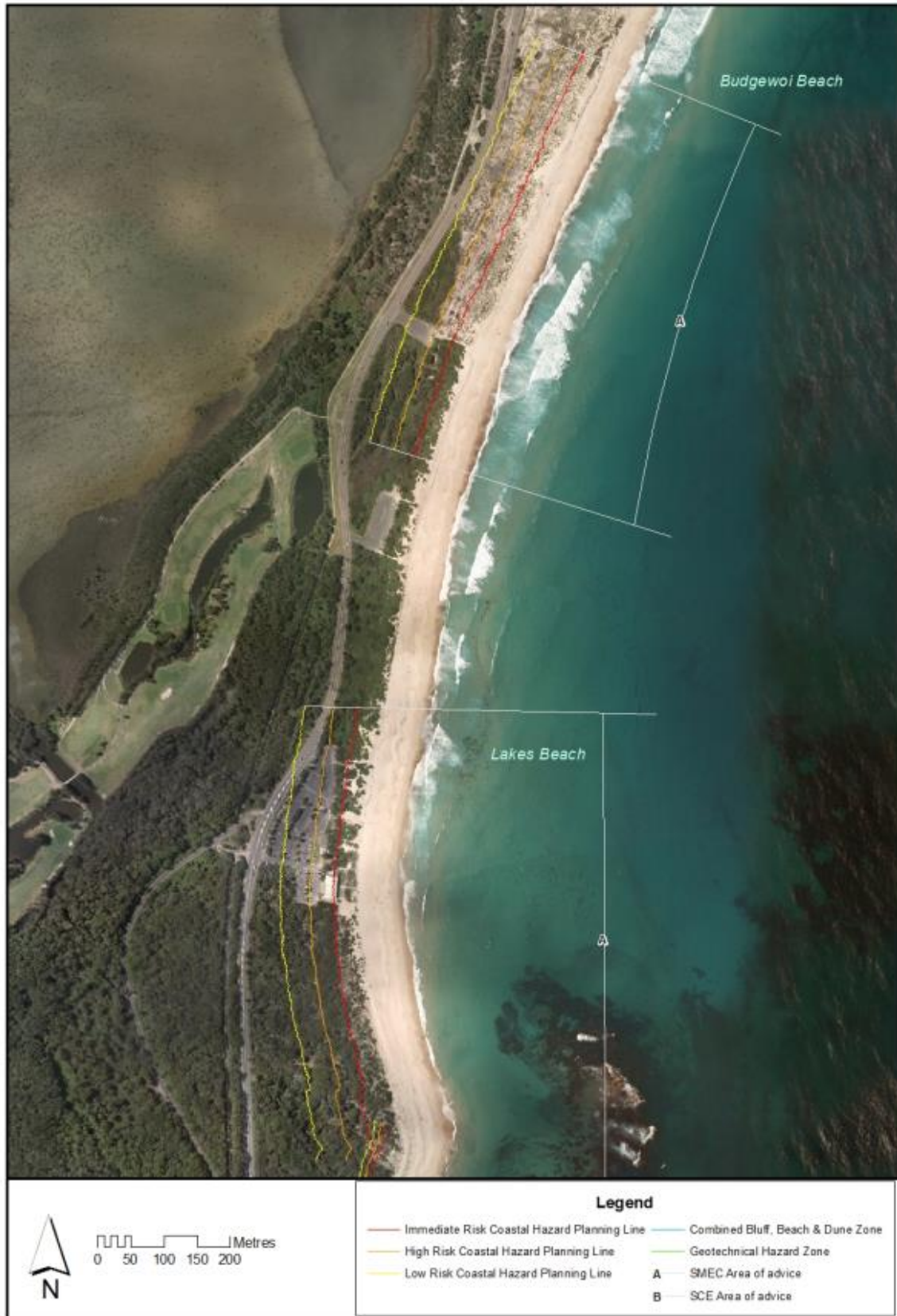
Budgewoi Beach to Lakes Beach