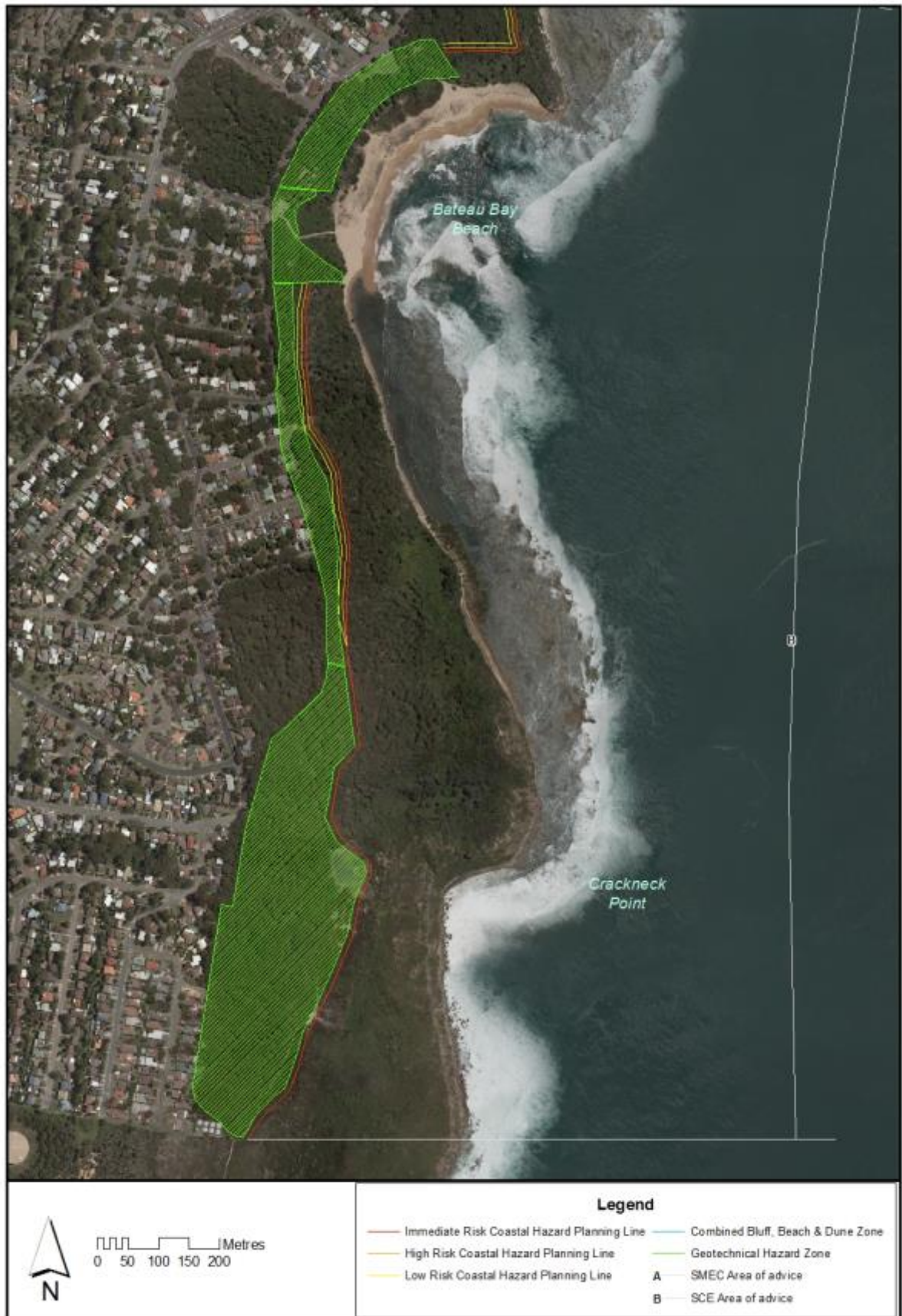
Bateau Bay Beach to Yumbool Point