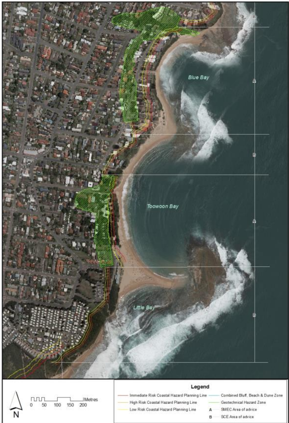
Blue Bay to Little Bay