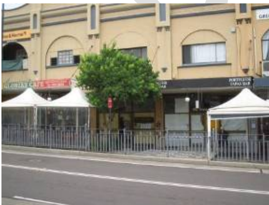
Figure 7 Shop front opposite ceramic mural