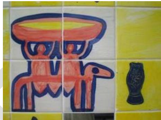
Figure 8 Ceramic mural