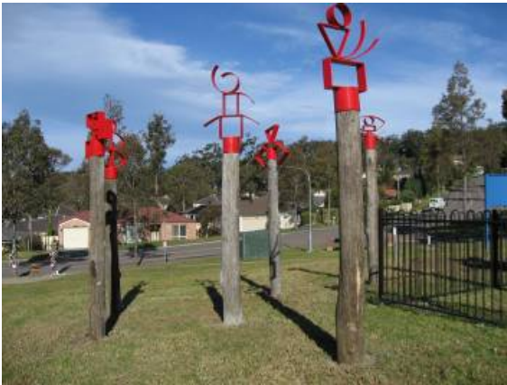
Figure 19 Artist and resident collaboration