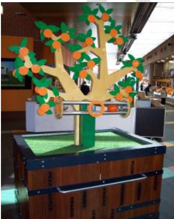
Figure 18 Interactive sculpture