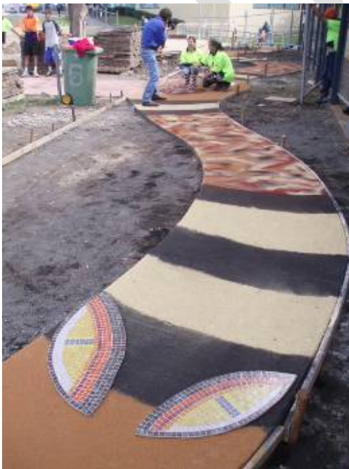
Figure 11 Integrated custom pathway