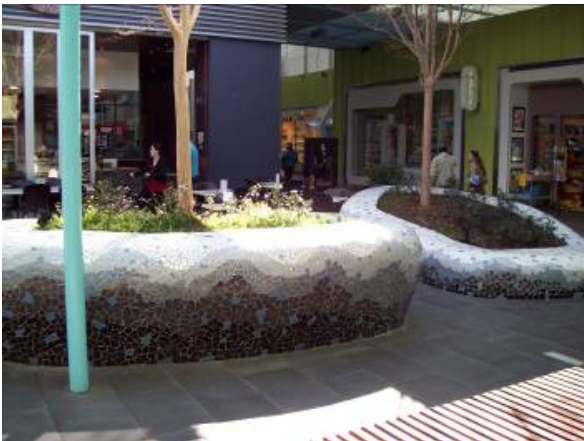
Figure 20 Custom designed garden-bed retainer