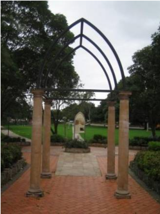
Figure 12 Heritage installation / gateway