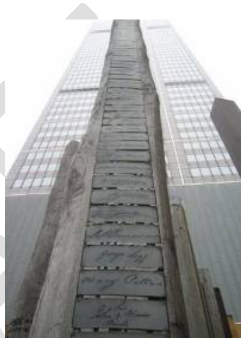
Figure 1 'The Edge of Trees'