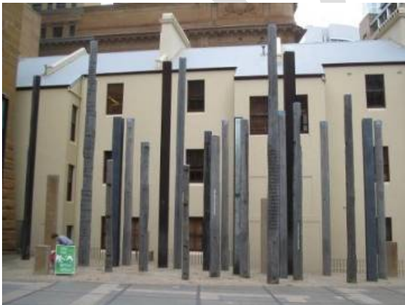
Figure 2 'The Edge of Trees'

The pillars symbolise the 29 Aboriginal clans from around Sydney and include wooden pillars from trees once grown in the area which have been recycled from demolished industrial buildings within Sydney. The work is an example of how public art can provide meaning by connecting modern localities to their cultural heritage.