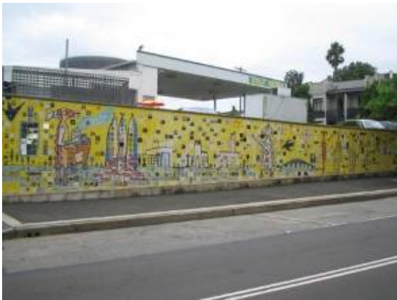
Figure 5 Ceramic mural

This mural was commissioned for placement opposite a Petersham café and restaurant strip frequented by many residents of migrant heritage, especially Portuguese. The mural was commissioned to commemorate the visit in 2002 to Marrickville of the Portuguese President and provides a definite identity to the street and is viewable from the shops opposite (see Figure 7).