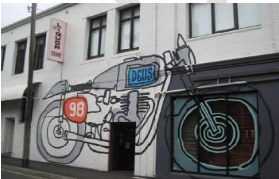
Figure 21 Mural graphic