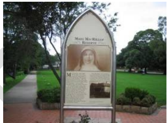
Figure 14 Heritage installation / gateway

As part of the City of Canterbury Heritage Program an unknown artist was commissioned to develop public art at Mary McKillop Reserve. The works resulted in the creation of an entranceway and resting place utilising custom designed components and interpretive signage, establishing the name and theme for a reserve whilst also being part of a 'heritage walk'.