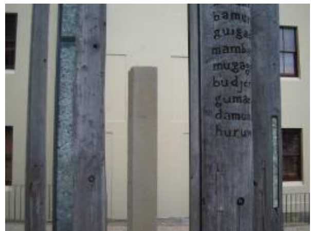
Figure 3 'The Edge of Trees'