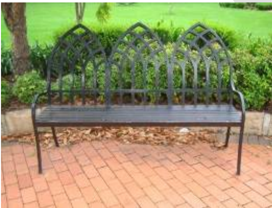
Figure 13 Heritage installation / gateway