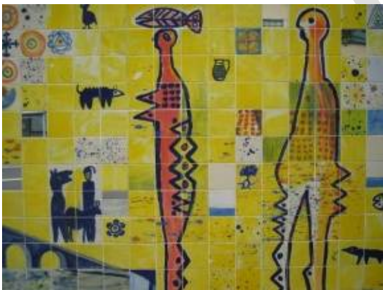
Figure 6 Ceramic mural