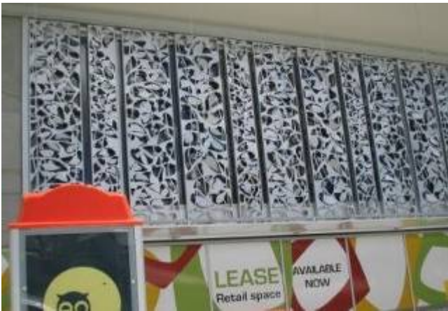
Figure 15 Façade treatment