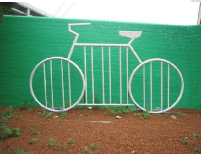
Figure 16 Custom designed utility