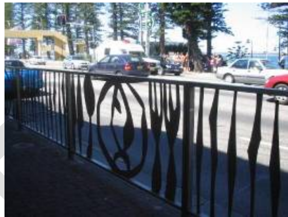
Figure 10 Streetscape custom fencing