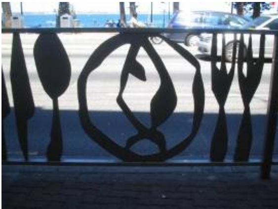
Figure 9 Streetscape custom fencing

Located along a restaurant and café strip and opposite the beach at Brighton Le-Sands, Sydney, this work sets the theme of food, eating and enjoyment, providing a less formal boundary between the footpath and road for pedestrians and motorists. It marks the area as a unique place and destination and as a place to remember.