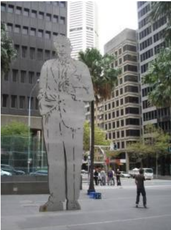
Figure 17 Single sculpture