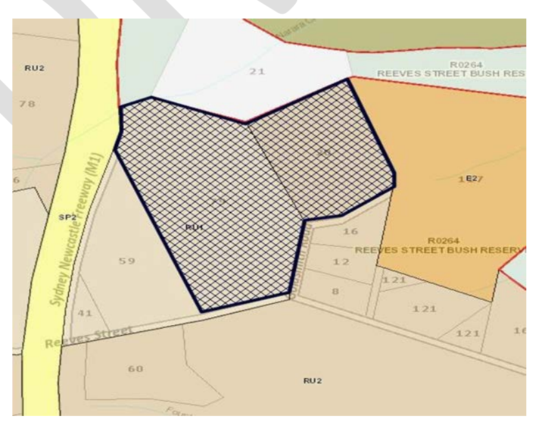
Figure 1 Northern Precinct

The northern precinct is zoned E2 Environmental Conservation and E3 Environmental Management. It is located off the Somersby end of Reeves Street and comprises Lot 12 DP 263427 (the rear section of which is to be zoned E2) and E3 Environmental Management over the remainder of Lot 12, and also for the whole of Lot 41 DP 771535 (see Figure 1 and Figure 2 below).