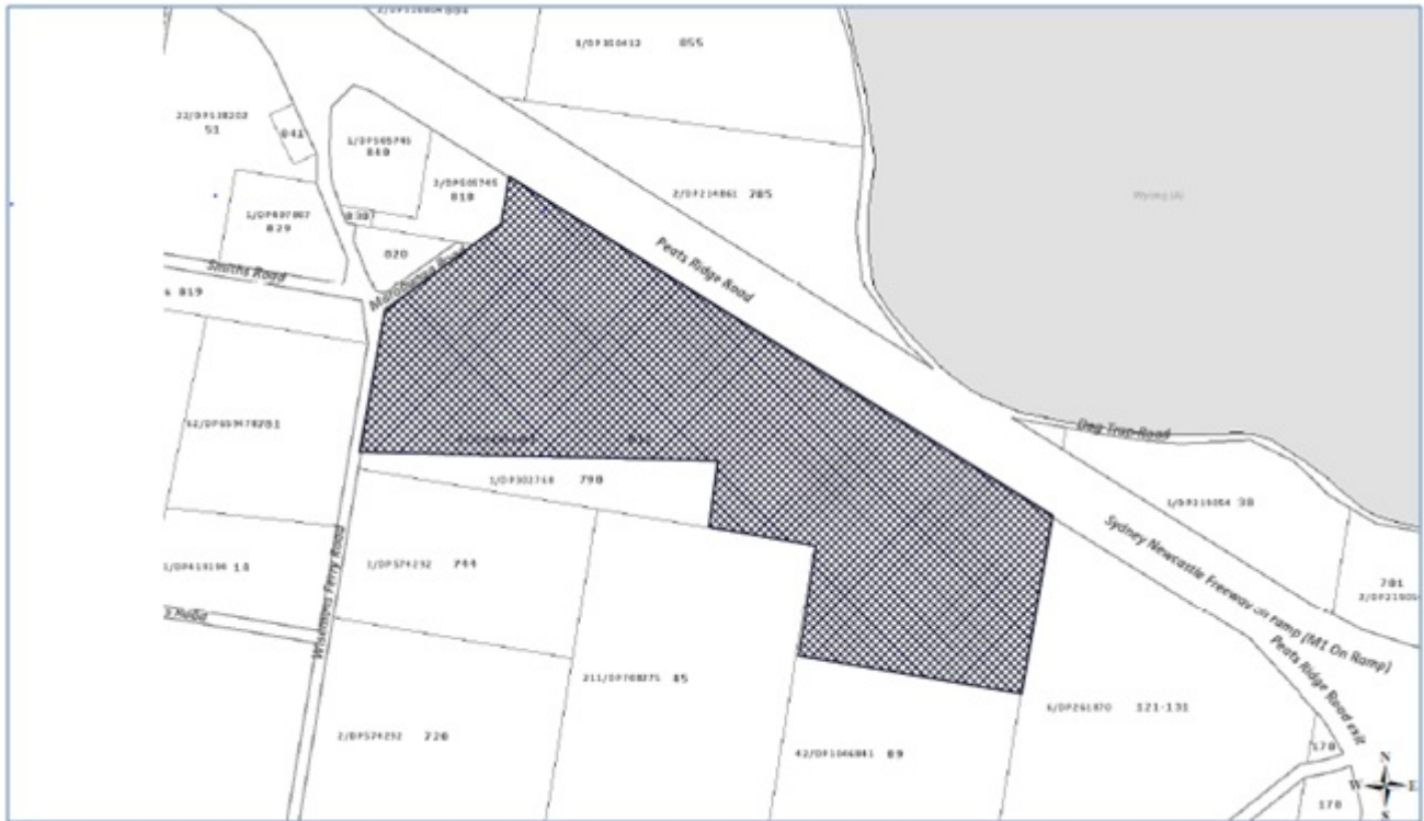
Figure 1 – Land to which this chapter applies

This DCP chapter applies to Lot 41 DP 1046841 Wisemans Ferry Road/Peats Ridge Road Somersby as shown on the map below.