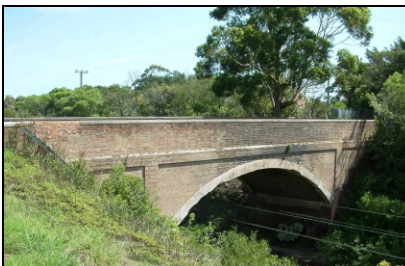
Local heritage A good example of a brick arch bridge associated with the early 20 th century electrification of the Illawarra rail line – Rail bridge, Thirroul , circa 1920s