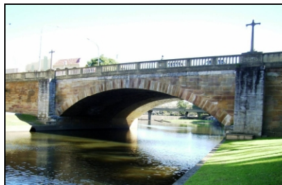
State heritage One of the oldest surviving bridges of colonial NSW, designed by the first colonial Superintendent of Bridges – Lennox Bridge , Parramatta, 1839