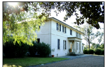
National heritage One of the finest Colonial Georgian residences and oldest surviving public building in Australia – Old Government House , Parramatta, 1799-1816