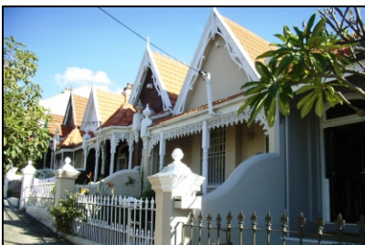
Local heritage Good examples of modest Victorian terraced housing of Paddington, demonstrating the 19 th century development of Paddington – circa 1890

Use of 'exceptional', 'high', 'moderate', 'little', 'low', 'intrusive' significance or other expressions of degree only relate to grading components of a place, not the overall level of significance of a place. These gradings are described in section 6 of Assessing Heritage Significance .