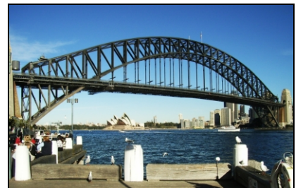
National heritage An Australian icon and landmark achievement of 20 th century engineering – Sydney Harbour Bridge , 1932