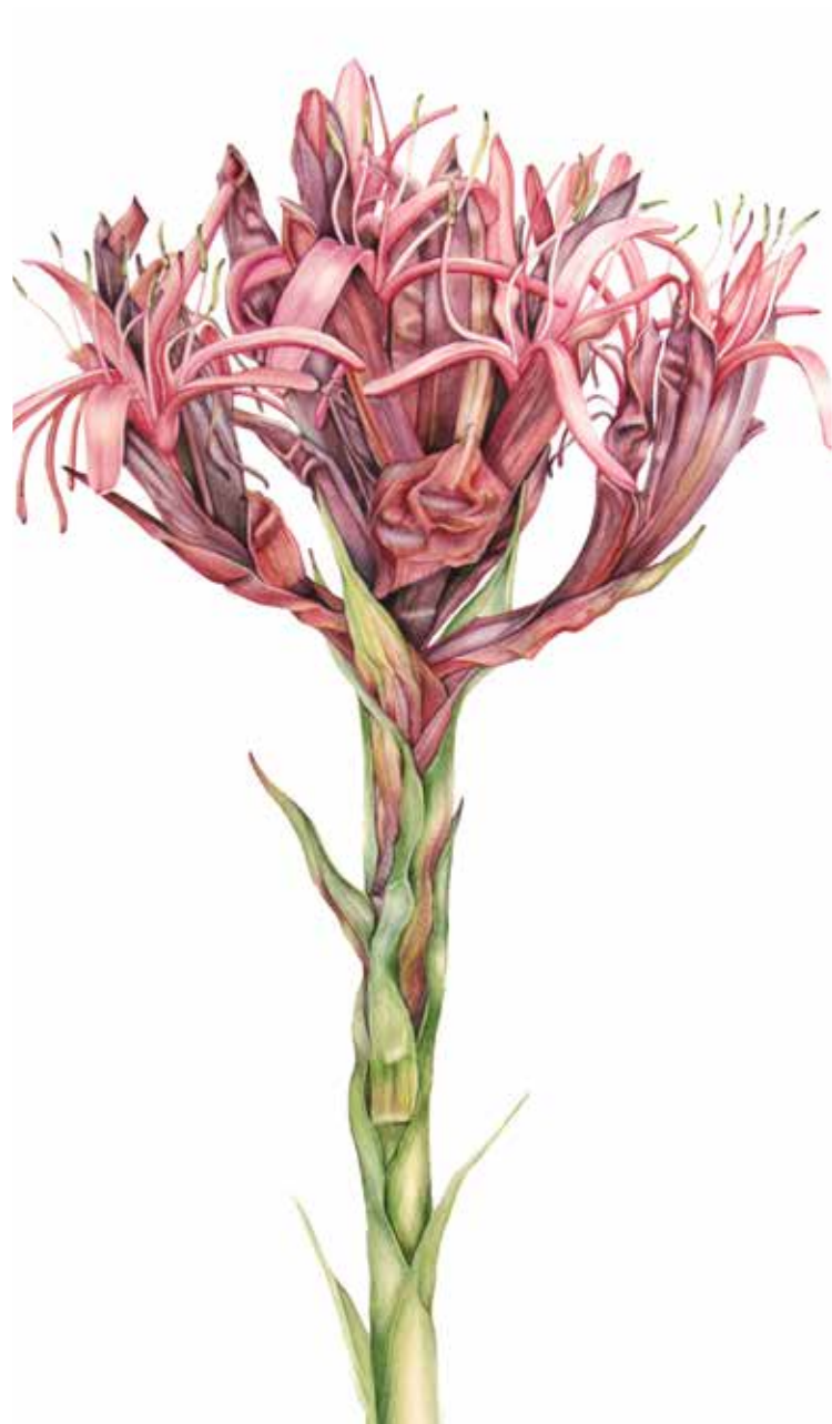
Gynea lily (Doryanthes excelsa) Illustration - Dr Tanya Hoolihan

Some natural resource management issues, such as biosecurity, bush fire and emergency management and coastal area, estuary, lagoon and wetland management issues are initiated by Council but are not restricted to public land in their application. These types of programs are collected together into Theme 5.