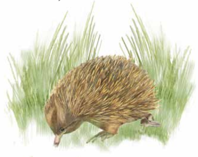
Short-beaked echidna - ( Tachyglossus aculeatus)

The Biodiversity Conservation Act 2016, together with the Biodiversity Conservation Regulation 2017, outlines the framework for addressing impacts on biodiversity associated with development and clearing in NSW. The Biodiversity Offsets Scheme is a framework to avoid, minimise and offset impacts on biodiversity, and to ensure land that is used to offset impacts is secured in-perpetuity.