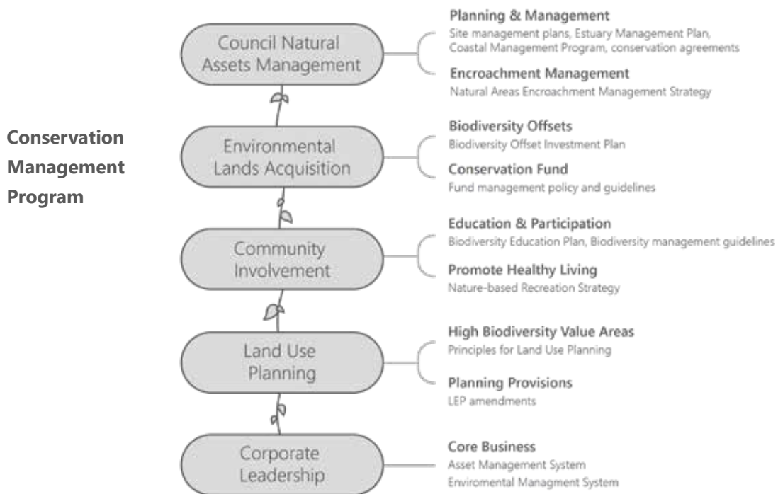
Figure 1: The main components of the proposed Conservation Management Program and associated key strategies, plans and policies

The actions under the first three themes will be delivered by the proposed Conservation Management Program (CMP). The CMP is a comprehensive program of works covering natural asset planning and management, expansion of Council's natural area estate, and community involvement in biodiversity conservation (Figure 1). Output documents from the CMP such as strategies, plans and policies, will be prepared as key actions of the themes.