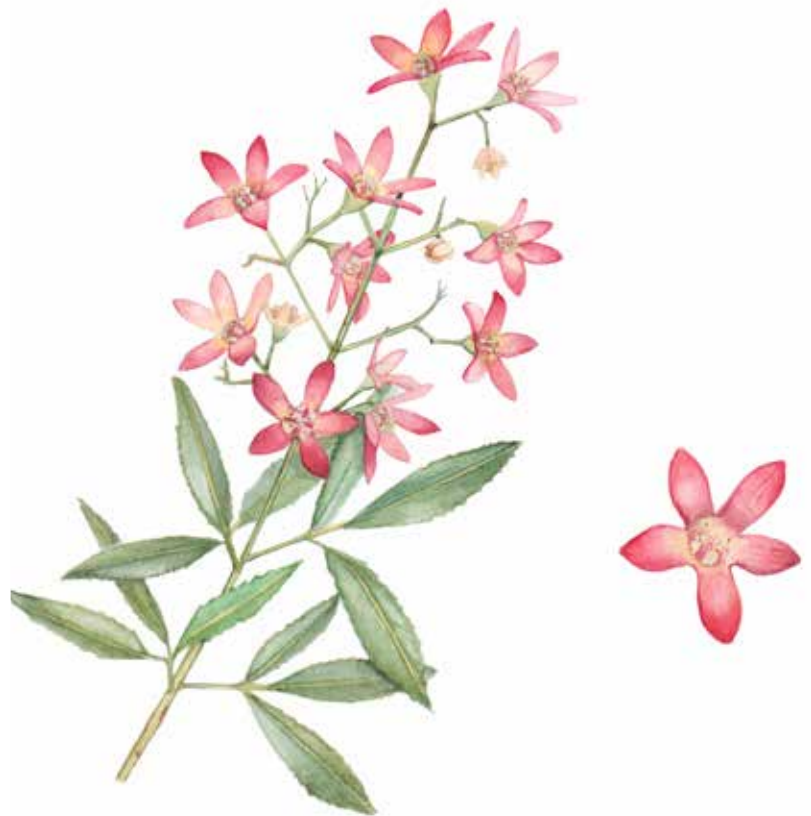
Coachwood (Ceratopetalum apetalum) Illustration - Dr Tanya Hoolihan

In formulating a framework for action, Council has developed the following five core principles to provide guidance for decision-making and other Council functions in order to achieve the objectives of the Biodiversity Strategy, especially in the context of future planning decisions and climate change impacts.