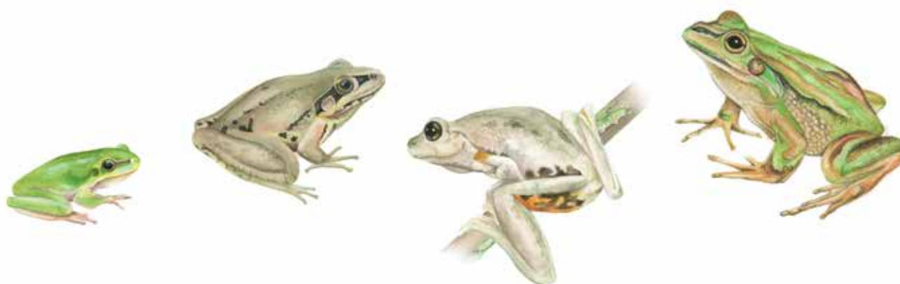
Eastern sedge frog ( Litoria fallax ), Peron's tree frog ( Litoria peronii ), broad-palmed rocket frog ( Litoria latopalmata ) and green and golden bell frog ( Litoria aurea ) Illustration - Dr Tanya Hoolihan