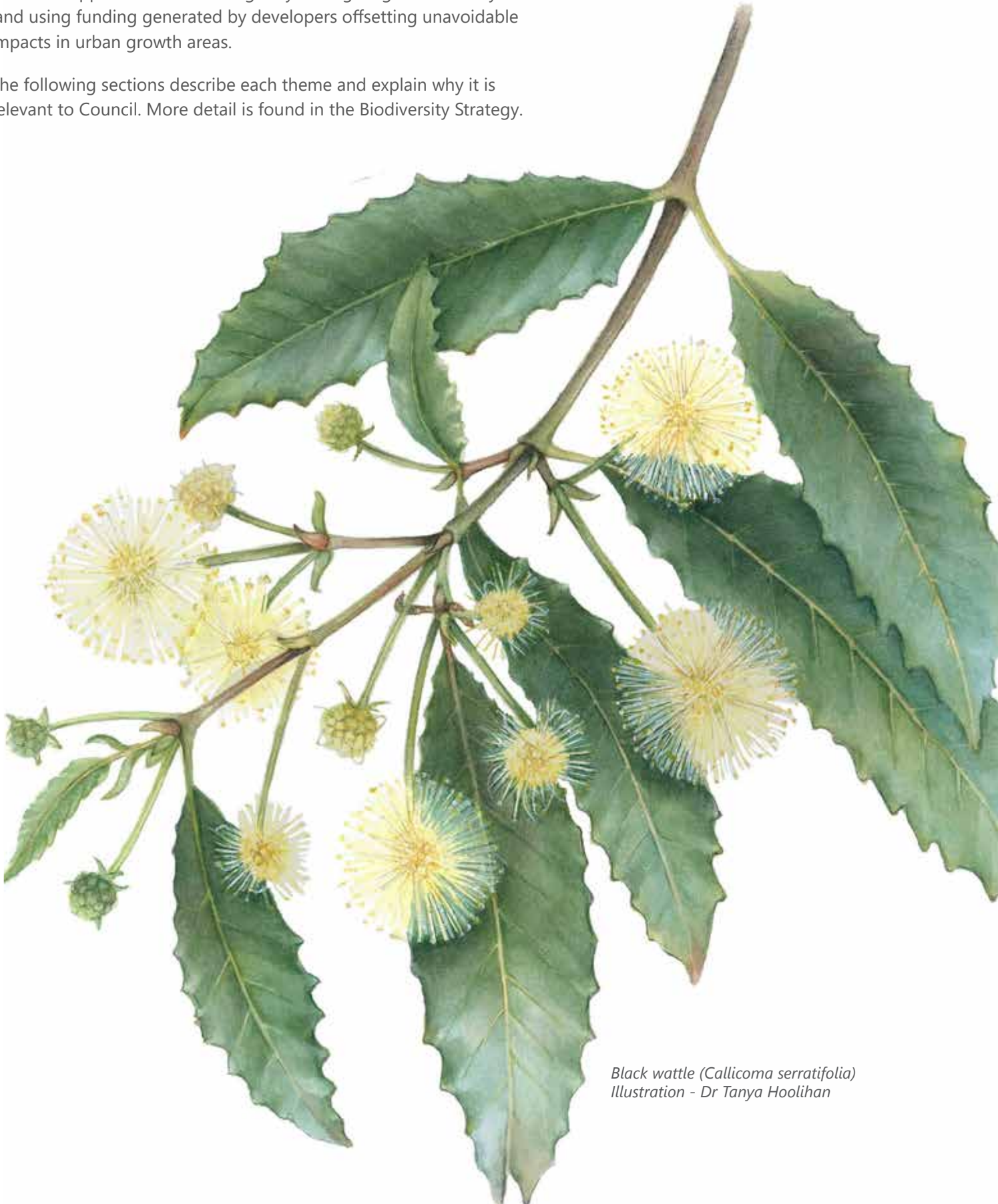
Black wattle (Callicoma serratifolia) Illustration - Dr Tanya Hoolihan

The following sections describe each theme and explain why it is relevant to Council. More detail is found in the Biodiversity Strategy.