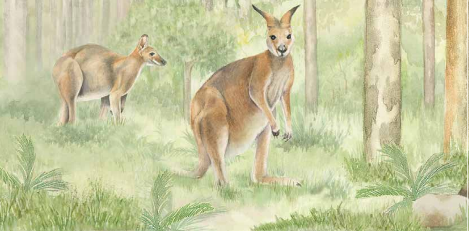
Red necked wallaby - ( Macropus rufogriseus ) Illustration - Dr Tanya Hoolihan