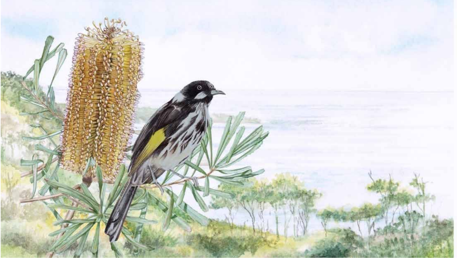
New Holland honeyeater (Phylidonyris novaehollandiae) and Banksia - (Banksia spinulosa)