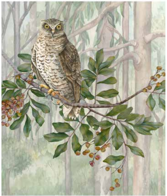
Powerful owl, Tuckeroo - Ninox strenua, Cupaniopsis anacardioides

The Strategy investigates mechanisms available to both secure land management funding and funding to expand the conservation estate. The following theme describes the NSW Biodiversity Offsets Scheme and how the funds generated by the sale of biodiversity credits will go back into the Conservation Management Program and the Environmental Lands Acquisition Program, the program nominated to acquire private land for the purpose of conservation. Land currently identified as 'proposed for acquisition' and other land identified for acquisition will be acquired under the Environmental Lands Acquisition Program as opportunities arise and funding allows.