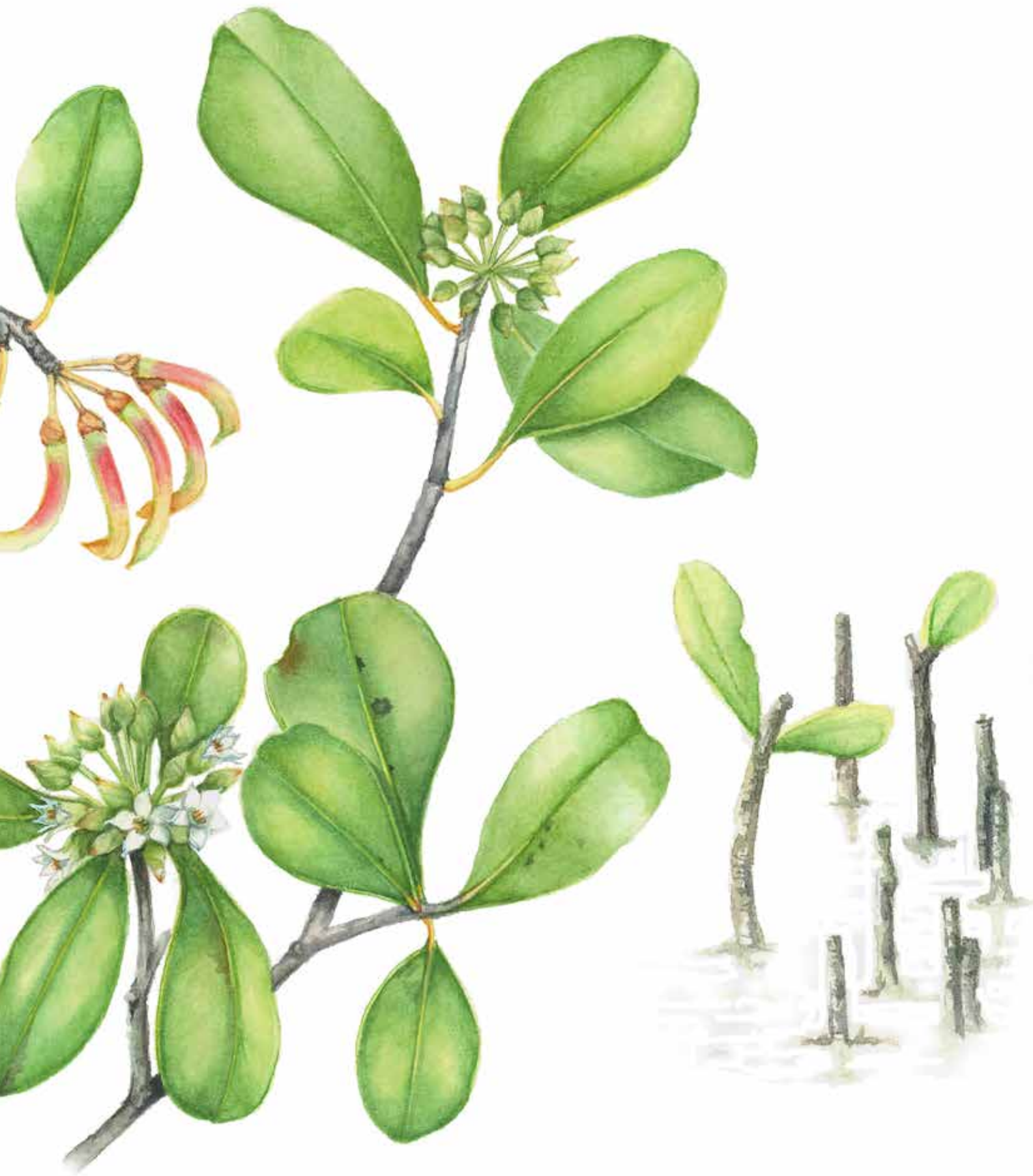
River mangrove ( Aegiceras corniculatum ) Illustration - Dr Tanya Hoolihan