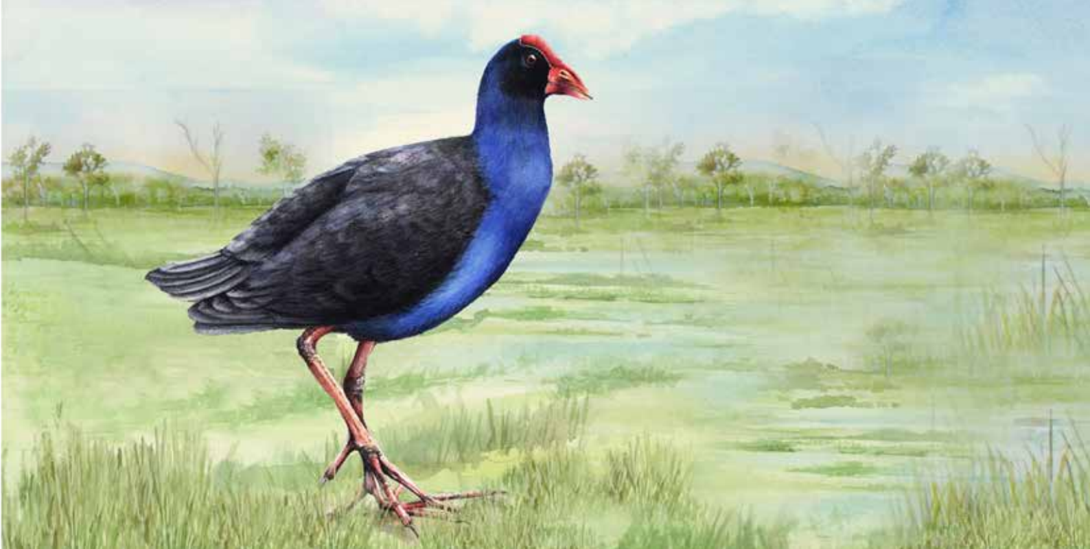
Purple swamphen (Porphyrio porphyrio) Illustration - Dr Tanya Hoolihan

The preparation of the Biodiversity Strategy is in direct response to the importance that the community places on the environment and is included as part of a suite of Council strategies aimed at implementing key Community Strategic Plan objectives. Other strategies include: