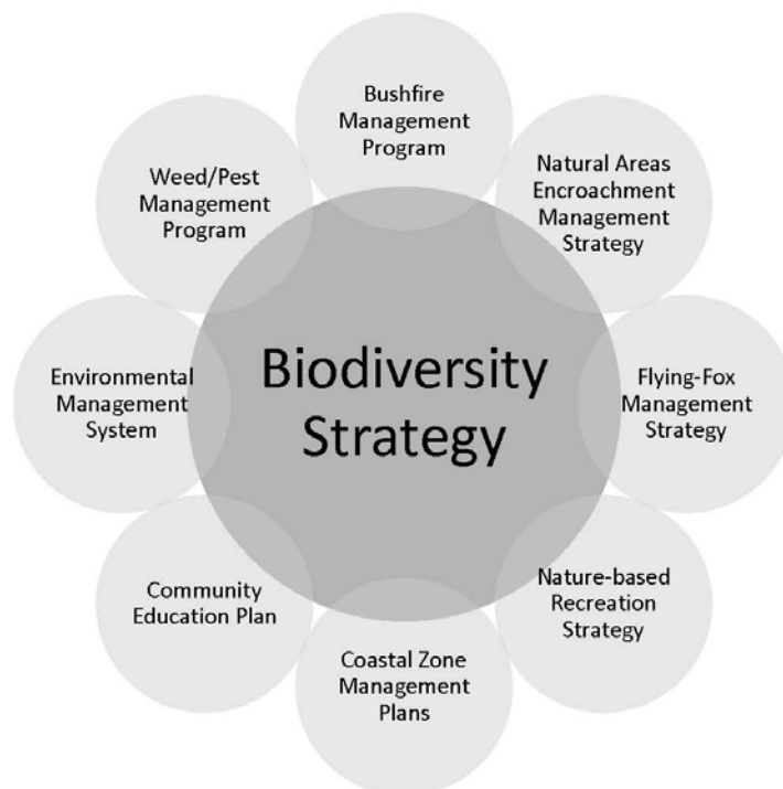
Figure 2: The actions of the Biodiversity Strategy complement other Council programs and plans, and therefore are not meant to be a comprehensive approach to all of Council's natural resource management.

Lastly, the Biodiversity Strategy acknowledges the exceptional and comprehensive work of the Council programs that contribute to biodiversity protection and management. There are many plans, programs, strategies and policies that are in place or are being developed that influence the success or otherwise of Council achieving the goals of the Biodiversity Strategy (See Figure 2 for some examples).