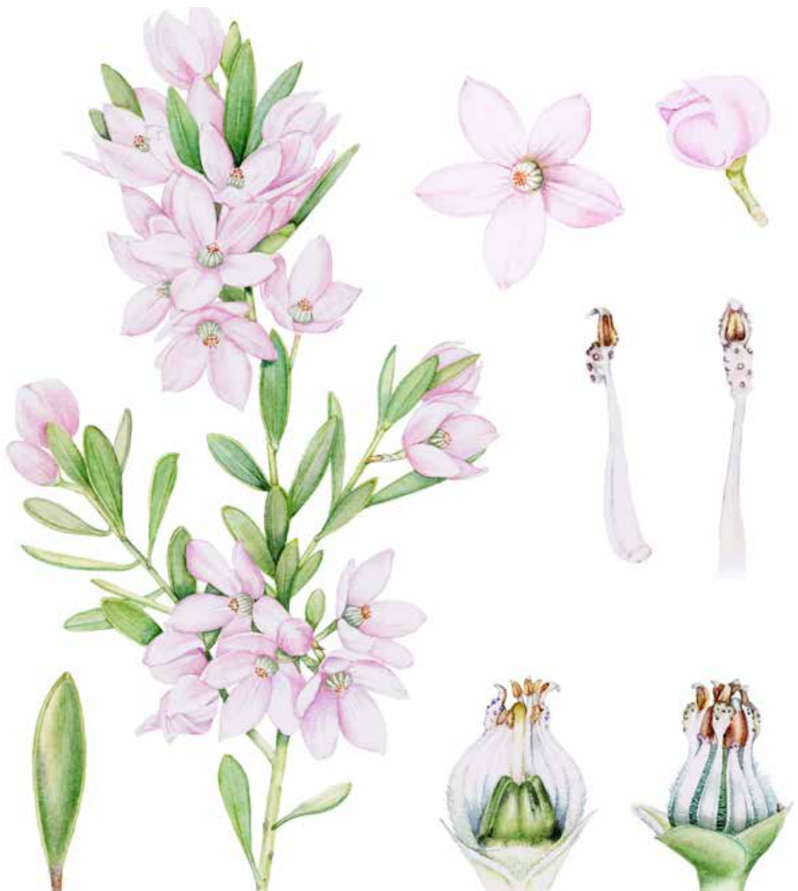
Pink wax flower - (Eriostemon australasius) Illustration - Dr Tanya Hoolihan

The plant community types identified in Tables 4 and 5 have high local significance and high conservation priority as a direct result of historical reduction in extent. Drivers for the loss and degradation of these communities are likely to be urbanisation, increased human population and climate change. The Conservation Management Program will further investigate these drivers of change and the consequences for the future broader landscape. Actions arising in the Biodiversity Strategy relate to updating the analysis of local significance with local-scale vegetation community type mapping (rather than the coarser plant community type mapping) and updated versions of the NSW plant community type mapping for the east coast.