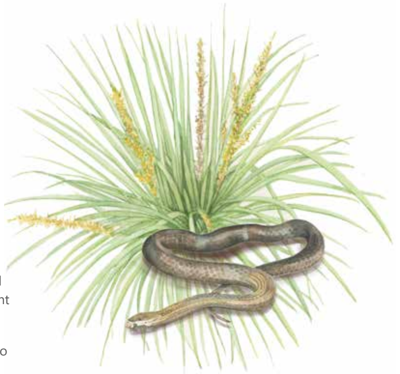
Golden-crowned snake - ( Cacophis squamulosu ) Illustration - Dr Tanya Hoolihan

The community values that “the natural environment is well cared for and protected” as recognised in the Community Strategic Plan, prepared following extensive community engagement. Themes emerged in participant’s concerns and ideas on the environment (Table 1).