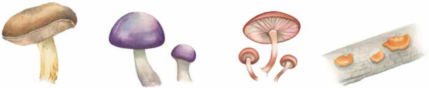
Assorted fungi - pretty grisette ( Amanita xanthocephala ), collared earth star ( Geastrum triplex ), Phlebopus marginatus , Cortinarius sp., Leratiomyces ceres , orange bracket. Illustration - Dr Tanya Hoolihan