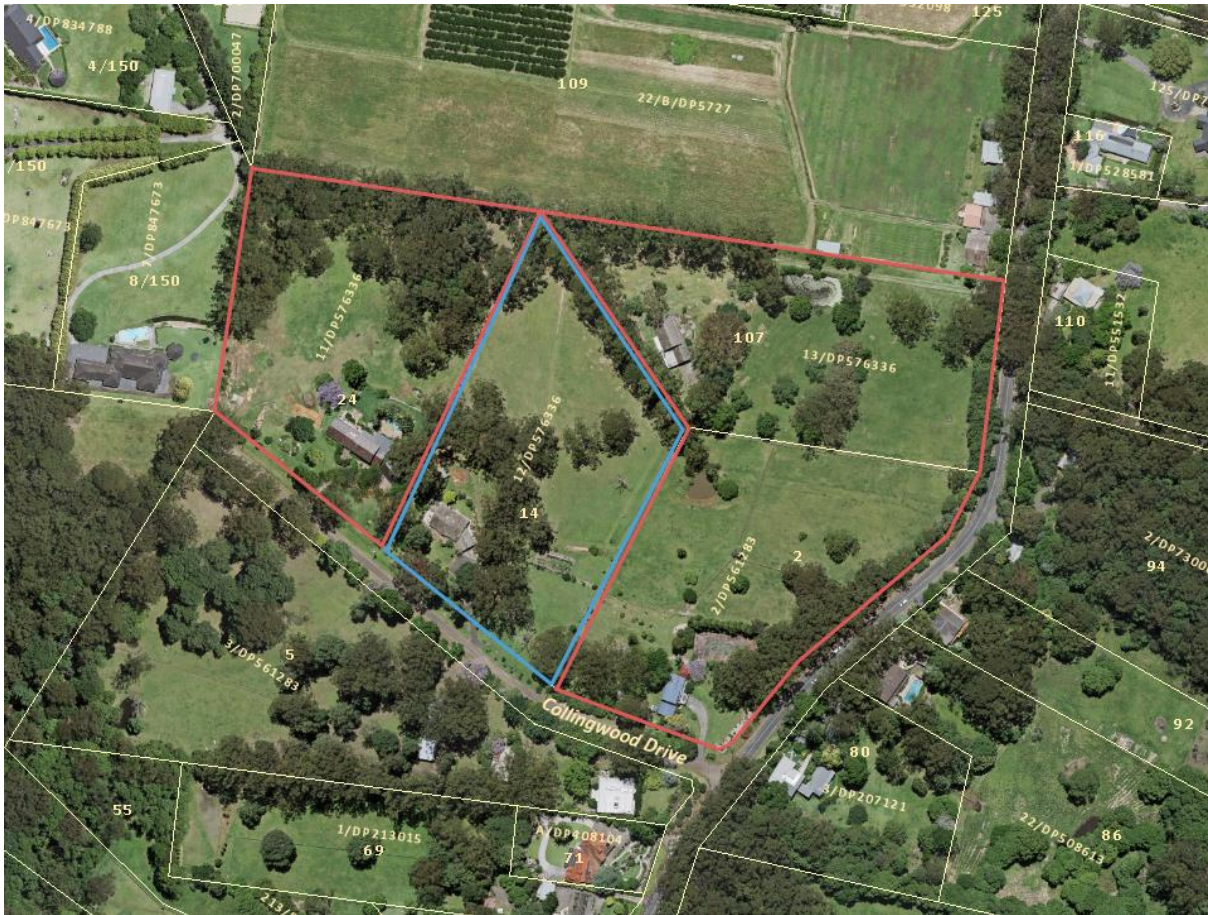
Figure 3: Locality Context Aerial (Sites subject of the application are shown edged in red and additional Lot 12 DP 576336 proposed to be included in the Planning Proposal shown edged in blue)