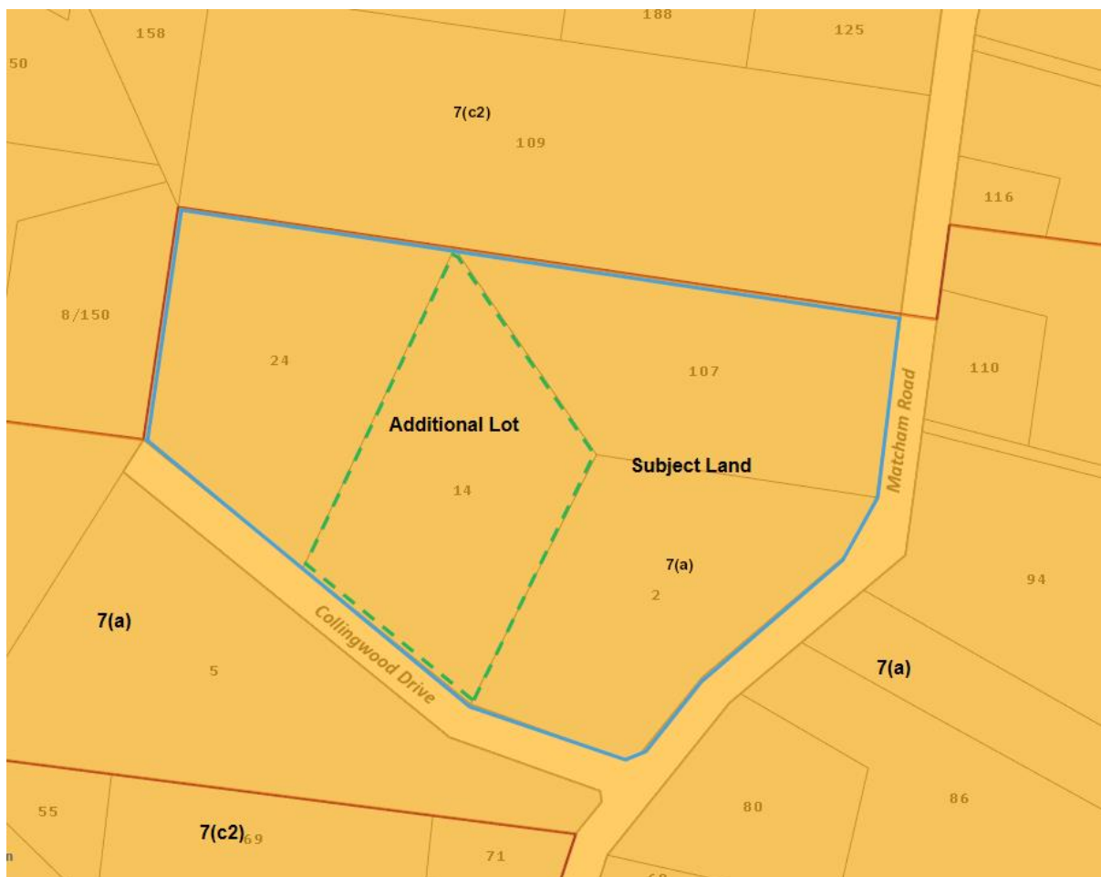
Figure 2: Zoning under IDO 122 showing the additional lot proposed to be included in the Planning Proposal

Land on the footslopes to the north and south of the 7(a) Conservation and Scenic Protection (Conservation) zoned land is zoned 7(c2) Conservation and Scenic Protection (Scenic Protection – Rural Small Holdings) (Figure 2).